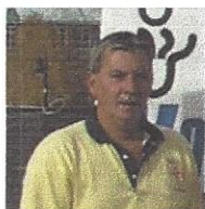
NHSA Lifetime Member: 14701 Spyglass Street, Orlando, Florida 32826